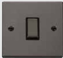
411 (425 intermediate switch)